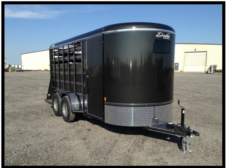
Trailer shown with optional 7' Tall height