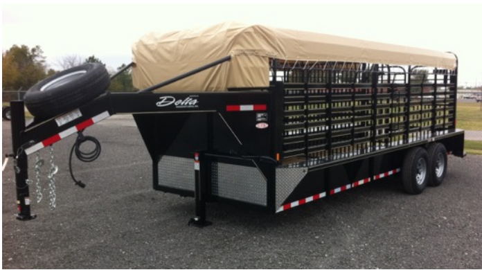
SHOWN WITH TAN CANVAS