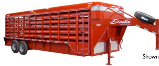
Shown with Steel Top