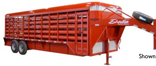
Shown with Steel Top