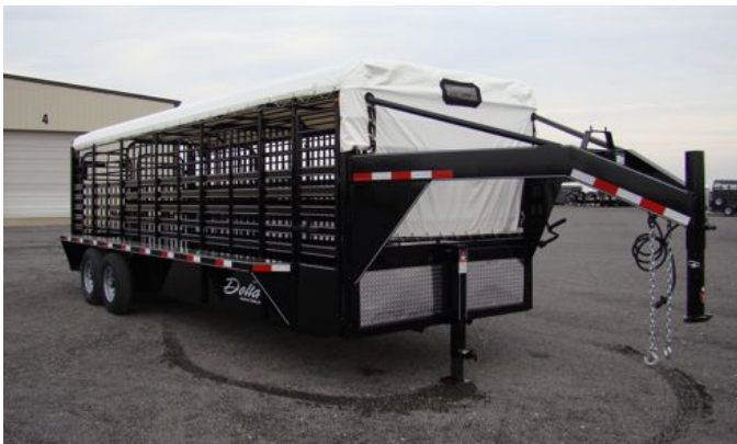
Shown with Canvas Top